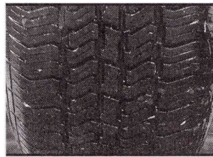
SIKKEMA JENKINS & COMPANY, NEW YORK