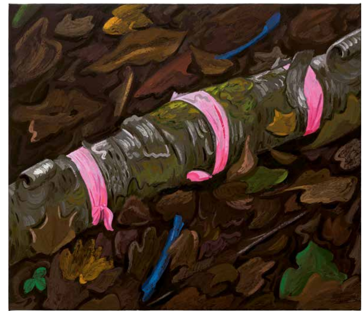
Former Corner Marker, 2017, oil on linen, 19 by 22 inches.

For this exhibition, I straddled invisible, legal boundaries with my body and equipment, painting signs of ownership—"no trespassing" posters, flagging tape, and metal stakes. Wherever my eyes landed, there were traces of neighbors, dead and alive. The ground is littered with inscriptions of its own history of possession. I thought about belonging. Now that I own a piece of the rock, do the trees that grow there belong to me? At what point does one become of a place?