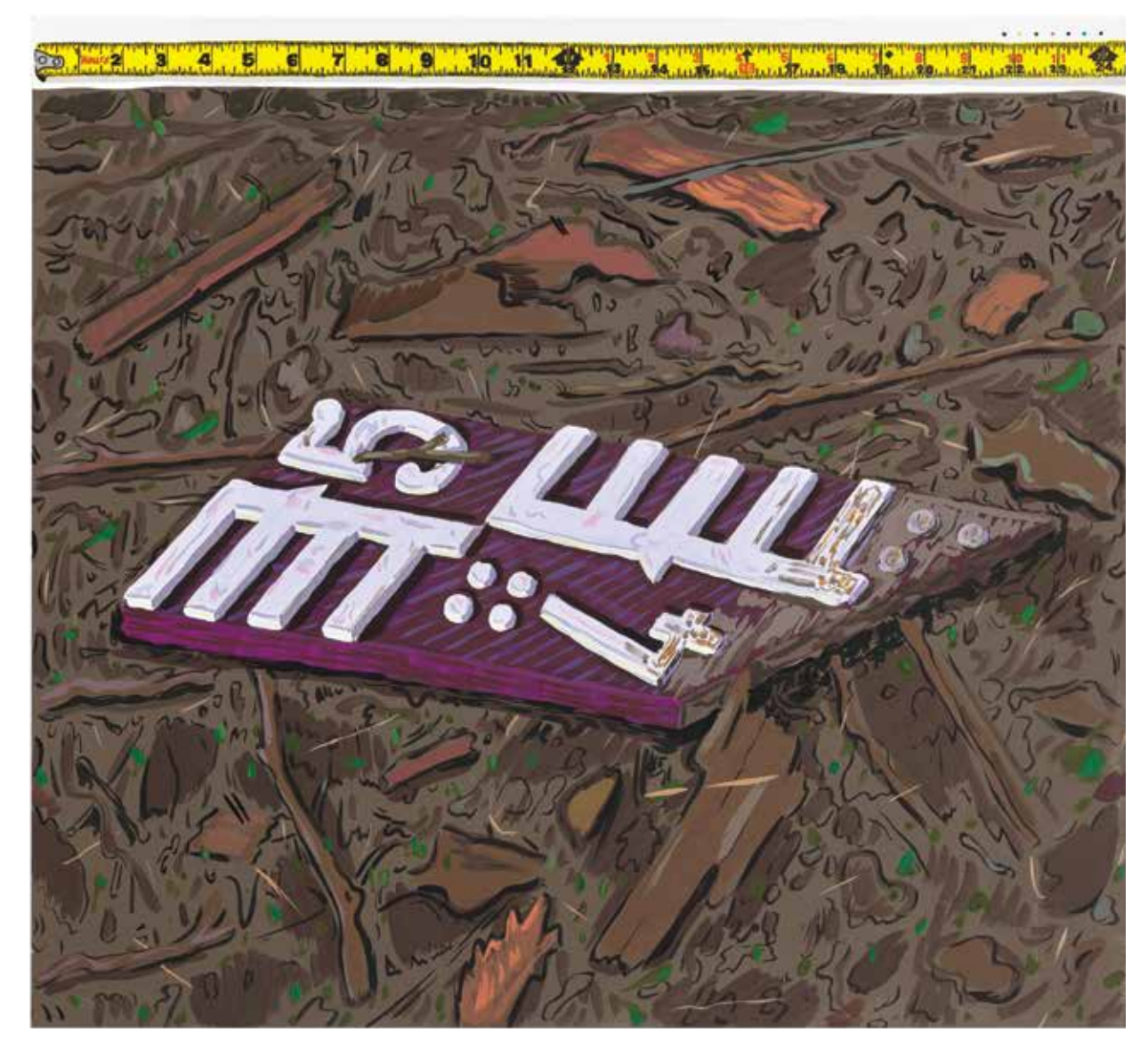
Broadsheet (Measure), 2017, gouache and silkscreen on paper, 22½ by 24½ inches.